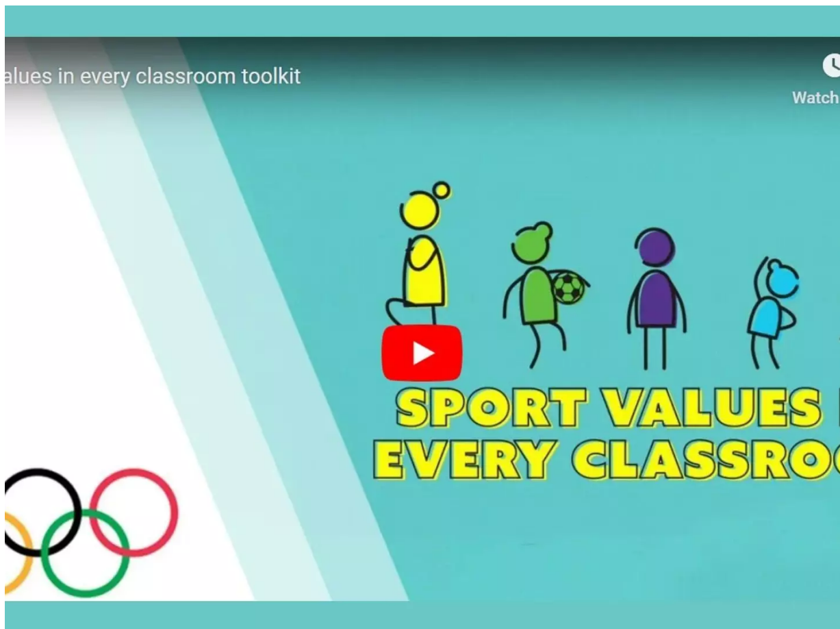
IOC - Sport Values In Every Classroom